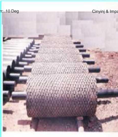
Carrying Idlrr; :10 Deg