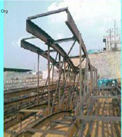
Cinyinj & Impact Ulrrs 45 Org