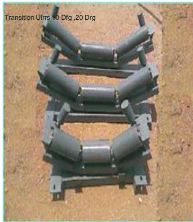
Transition Ulrrs 10 Dfg ,20 Drg