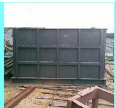
Surge Hopper Kin

TOUGHROLL™ A PRODUCT BY CNC VISWAKIRTI CONVEYORS SDN. BHD.